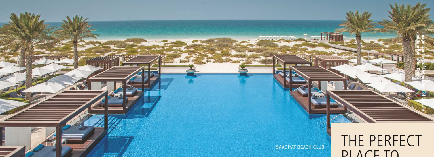
SAADIYAT BEACH CLUB